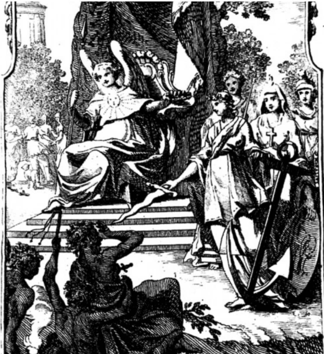
THE FEMALE SPECTATOR VOLUMES 1 AND 3 FRONTISPIECES