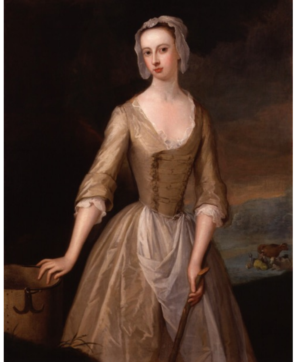
CATHERINE DOUGLAS, c. 1725-1730. National Portrait Gallery .

T O HER GRACE The DUTCHESS of Queensberry and Dover, THIS THIRD VOLUME OF THE FEMALE SPECTATOR IS Most Humbly INSCRIBED By HER GRACE'S Most devoted Servants, The AUTHORS.